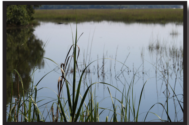
Beaufort, SC

Do you have a photo that you took in the Beaufort / Lowcountry Area that you would like to share with readers? Submit photos to Lion Dana and then look for them here!