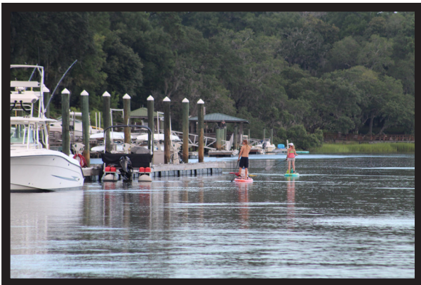
Boat Landing - Beaufort, SC