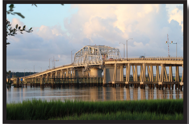
Downtown Beaufort, SC