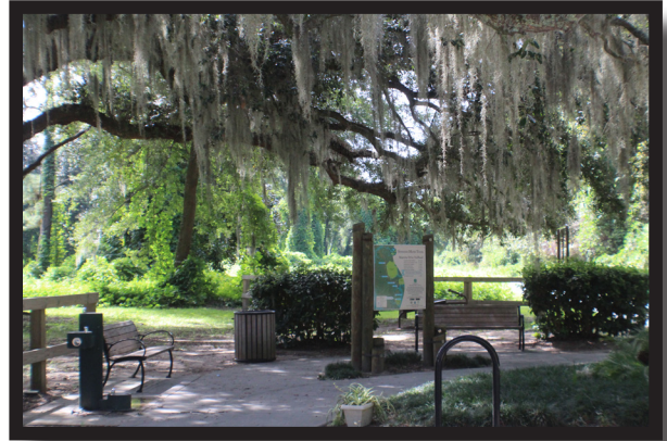
Spanish Moss Trail, Beaufort, SC