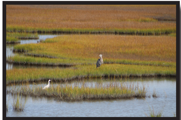
Great Blue Herons, Beaufort, SC

Do you have a photo that you took in the Beaufort / Lowcountry Area that you would like to share with readers? Submit photos to Lion Dana and then look for them here!