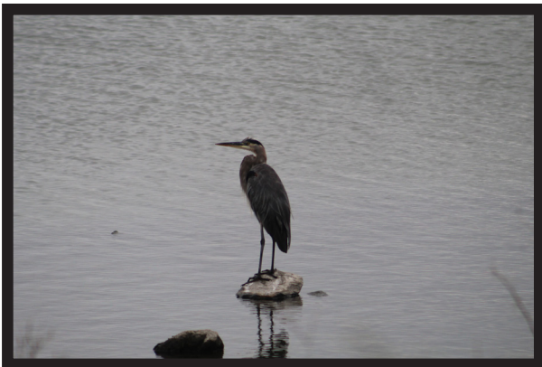
Great Blue Heron, Beaufort, SC