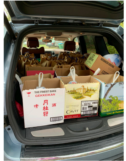
Meals all packed up and ready to distribute!

Pat and Jim spent 6 hours delivering food for Thanksgiving. Starting on Sams Point Road to Coosaw Island, then out to Seabrook, Laurel Bay, Port Royal, downtown Frogmore, Lands End and Horse Island.