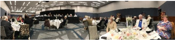
This photo illustrates the elegance of the gala as well as social distancing.